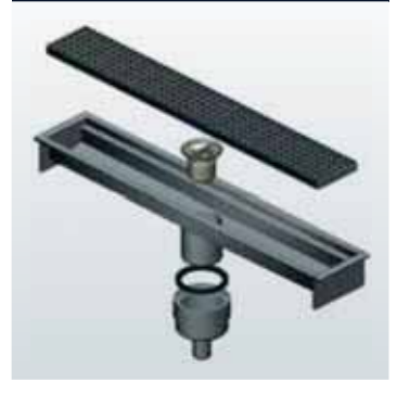
Standard, modular and custom-made channels and kitchen channels all in stainless steel.