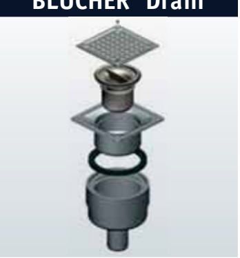
Stainless steel point drains for all types of deck floors. Height adjustment, rotation, tilt and removable water trap.