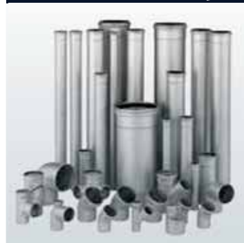
Complete range of push-fit pipes and fittings in stainless steel from OD40 to OD200 mm.