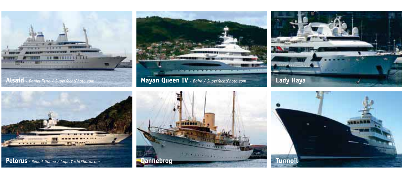
Reference list available on request